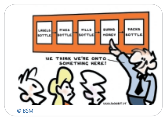
Phase 6 - Presentation Phase

The objective of the Development phase is to select and prepare 'best' alternatives or combinations of alternatives for improving value. Each of the remaining concepts are further analysed in a decision process that allows the 2 key components governing any decision to be clearly understood: the benefits we hope to gain and what we must pay to obtain them.